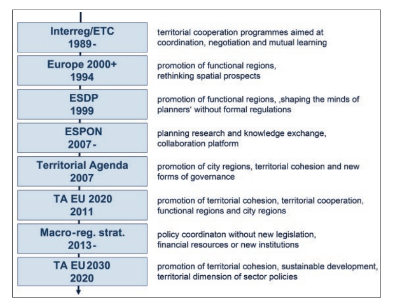
Fig. 2: Pan-European instruments for spatial development (own draft, cp. Purkarthofer 2016)

At the European level, border regions are mostly addressed with 'soft' spatial development tools, as there is no explicit EU mandate for spatial planning from a political perspective (Allmendinger et al. 2014). Cross-border spatial planning is hampered by barriers of administrative borders and, consequently, different planning systems (Fricke 2015, Kurowska-Pysz et al. 2018). These processes face different responsibilities, a high degree of actor diversity, and different planning cultures and paradigms (Bakry/Growe 2022, Peña 2007, Zimmerbauer/Paasi 2020). A comprehensive